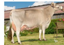
Dam: Lisele EX-90