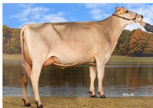
Walsers Brice UNA