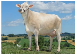
Dam: Pennie GP-82

The highest foreign bull in Germany from a new cow family