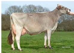
Dam: Olvsee GP-82