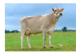
Dam: Pacotille VG-87