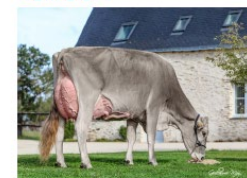
Granddam: LBB Lalice EX-92

New heterozygous polled for a famous family