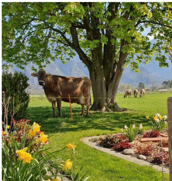
Widrig's Eagle Reika

The only cow family purchased is the D-line. The foundation cow, Vigor Daisy, was purchased as a heifer from a professional colleague who gave up dairy farming. This line is also convincing in all important traits that distinguish the farm.